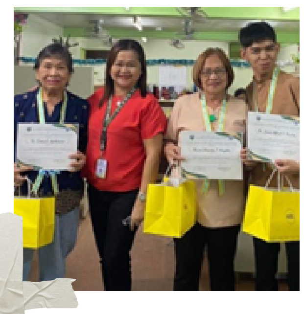
May all the joy you have spread around come back to you a hundredfold