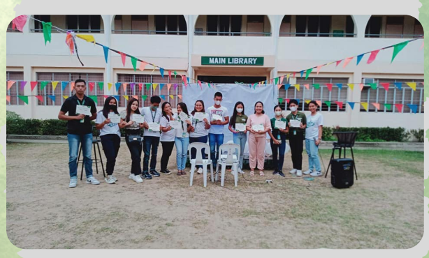
AWARDING OF CERTIFICATES