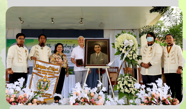
POSTHUMOUS AWARD FROM THE ORDER OF THE KNIGHTS OF RIZAL