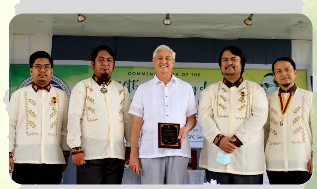
POSTHUMOUS AWARD FROM THE ORDER OF THE KNIGHTS OF RIZAL